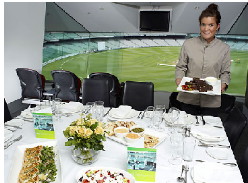
Corporate Box Dining

The Corporate Box package provides the following benefits:-