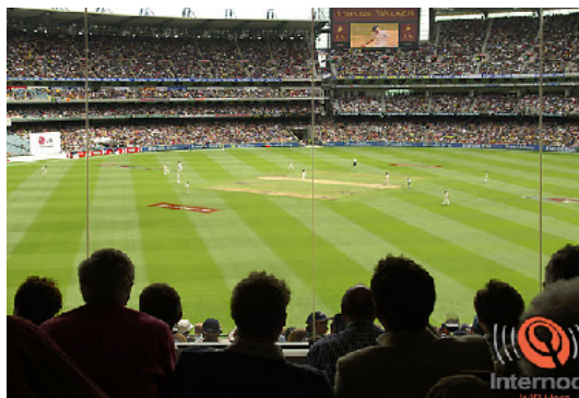
Panoramic view Jim Stynes Room