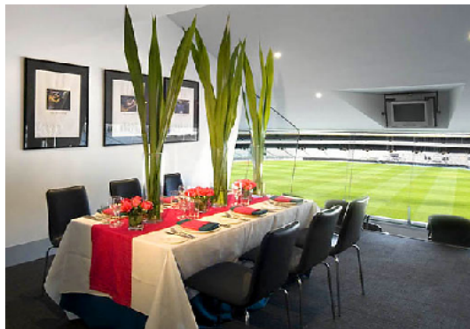
The Corporate Box

MSE Events Group has access to several Corporate Boxes at the MCG for the Summer of Cricket